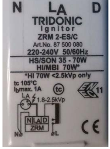
Page 3 of 4

This test report was issued by LightLab International without alterations or amendments