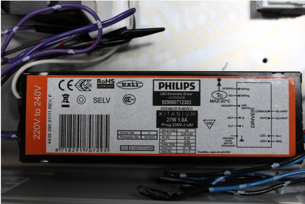
Control Gear - End of Report -

Unless otherwise stated the results shown in this test report refer only to the sample(s) tested. This test report cannot be reproduced, except in full, without prior written permission of the Company. 除非另有說明，此報告結果僅對測試之樣品負責。本報告未經本公司書面許可，不可部份複製。