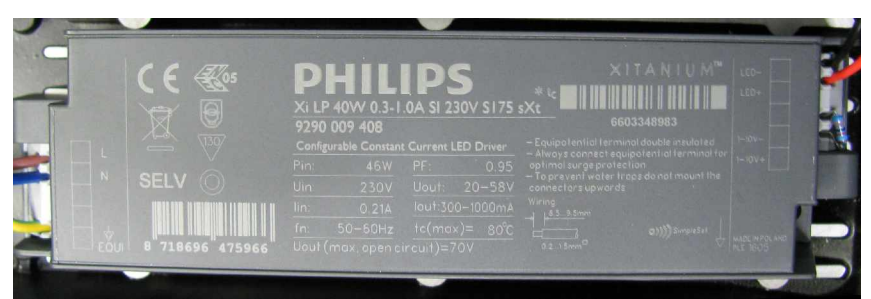
Illustration 3: Philips Xitanium driver